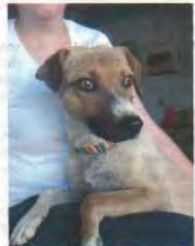
Ginger—2 year old spayed female Greyhound mix