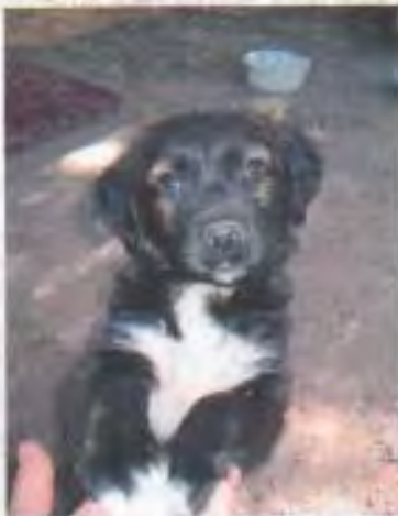
Mimi— 8 week old female Border Collie mix